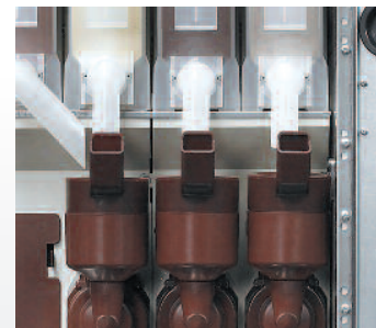
High performance FAS mixer with integrated extraction system