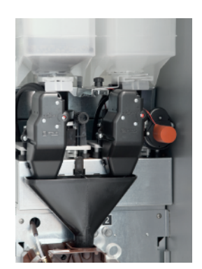
Automatic regulation for Top coffee grinding