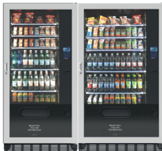
Fas 900 Advanced + Fas 1050 Advanced