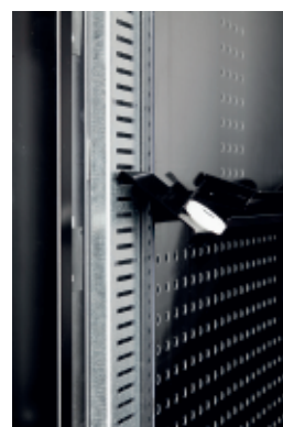
Easy click System