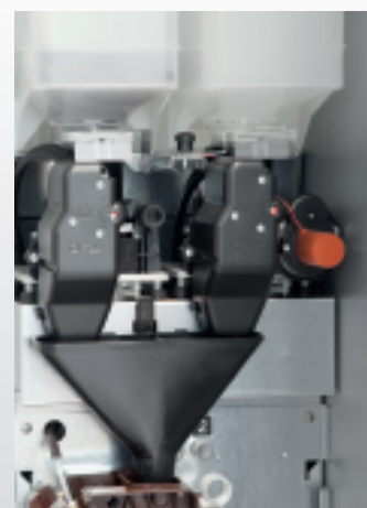
Automatic regulation for Top coffee grinding