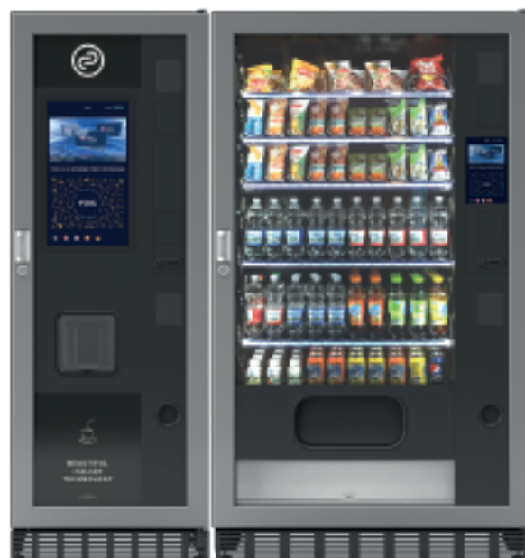
Fas Vicotira + Fas 1050 Pro