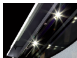
Internal lighting with side and top power LEDs