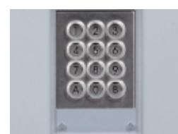
Illuminated keypad protected by 5 mm Lexan sheet