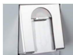
Vandal-proof coin slot