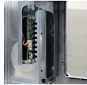
Photocells for the recognition of cups of up to 3 different heights