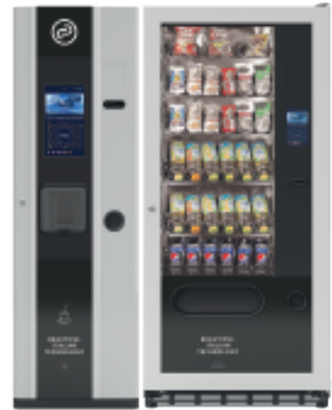
FAS Mia + Fas 750 Business