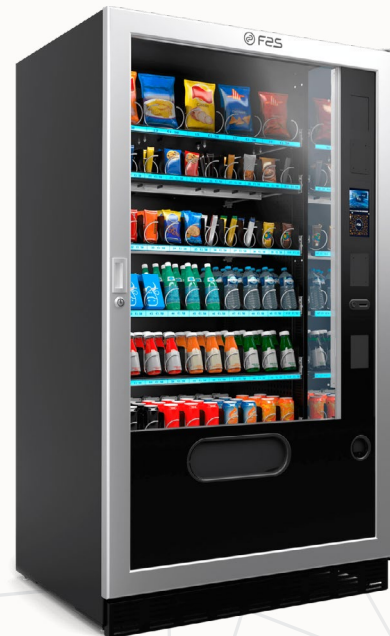
ADVANCED 750 ADVANCED 900 ADVANCED 1050 ADVANCED FV