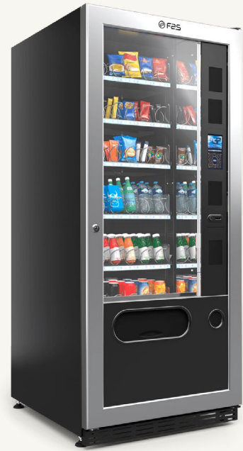
BUSINESS 750 BUSINESS FV