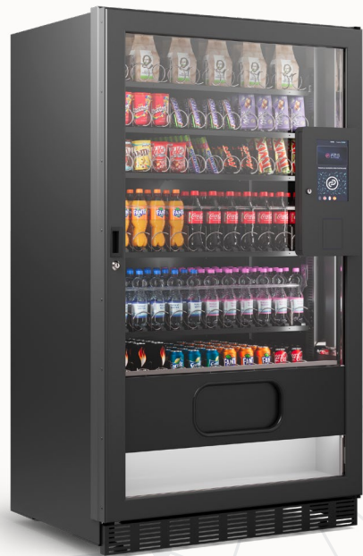
CASHBACK 10 CASHBACK 12