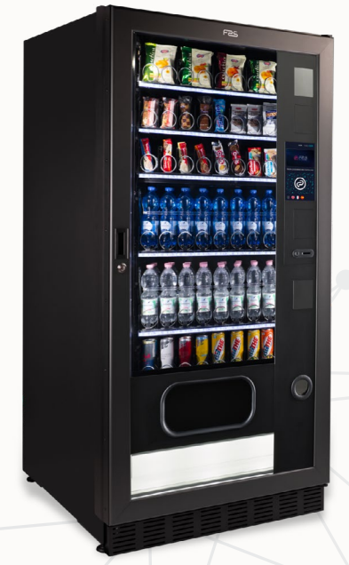
PRO 900 PRO 1050 PRO FV