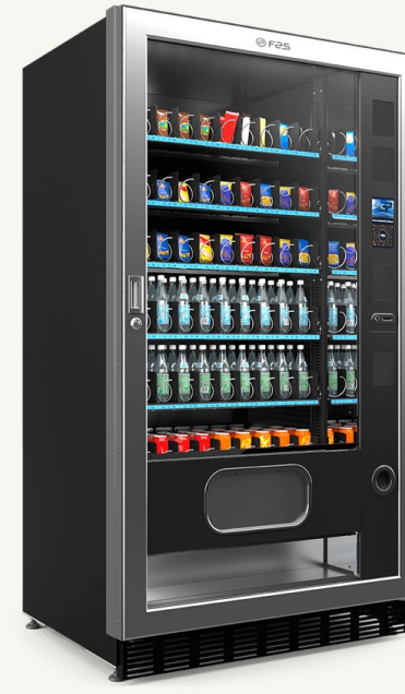
EXCELLENCE 750 EXCELLENCE 900 EXCELLENCE 1050 EXCELLENCE FV