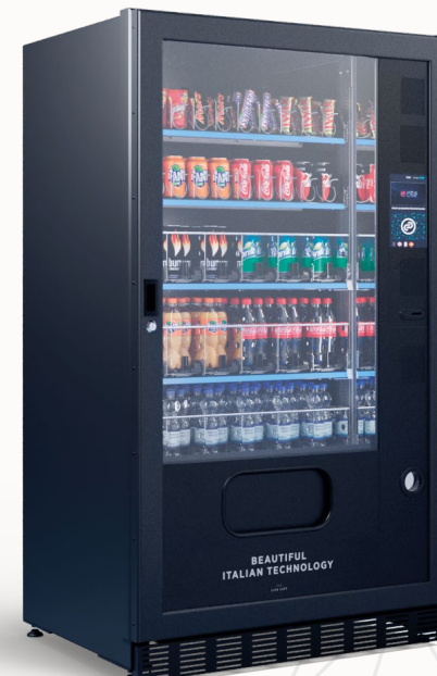
LITE LIFT POWER LIFT